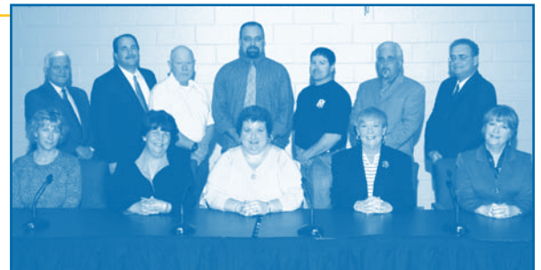
Greater Egg Harbor Regional High School District Board of Education

Education. The School Construction Corporation (SCC) will fund a significant portion of the project. In order for the district to receive this funding assistance, we must pass the referendum scheduled for September 25, 2007. We are embarking on a plan of information-sharing opportunities and we want to hear from you. We are offering several avenues for you to ask questions, voice your concerns, and share your opinions. The next page will offer more in-depth information about the process and the proposed new high school. We are looking forward to hearing from you.