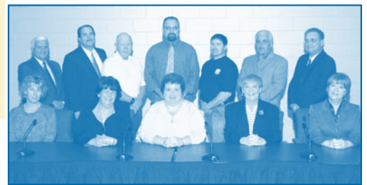
Greater Egg Harbor Regional High School District Board of Education

Your vote is important. Please vote on September 25.